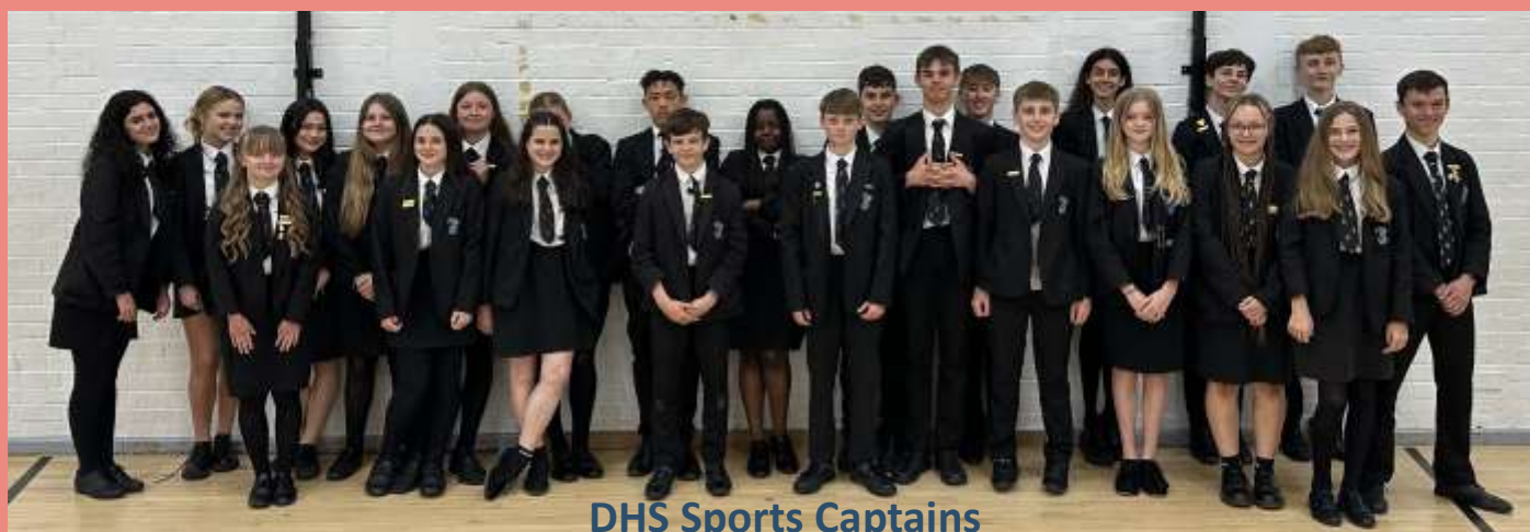
DHS Sports Captains