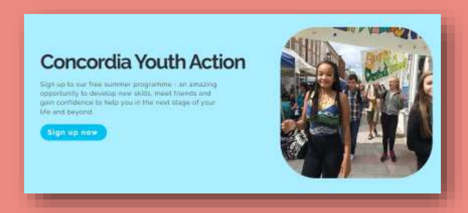
Opportunity for year 11 with Concordia Youth Action

Any year 11 students who missed the open days for Chichester or Brinsbury Colleges still have an opportunity to visit. Private tours can be booked for either college over the half term break on the link <u>here.</u>